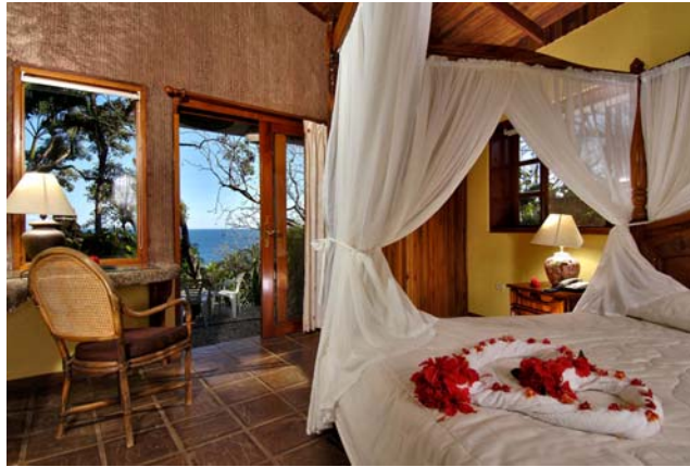
Tropical Suite (Jacuzzi)