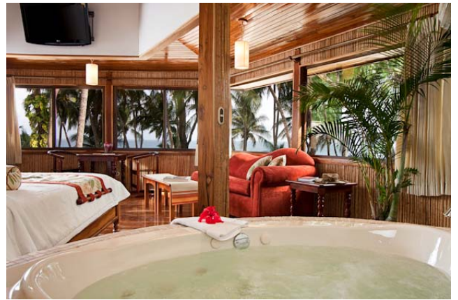
Tiki Suite (Jacuzzi)